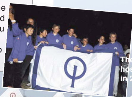
The IODA flag goes to Chile, host of the South Americans in 2011