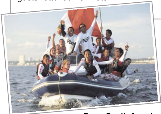
Peru: South American Team Race Champions 2010