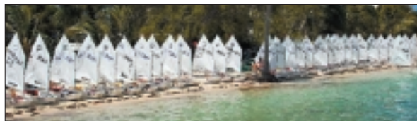
Bahamas - we only subsidised the first 18!

Over the last four years more than 180 Optimists in twenty countries have been acquired under this scheme.