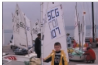
Serbia & Montenegro

But if, for example, the South Pacific can produce world class rugby players, why not sailors?