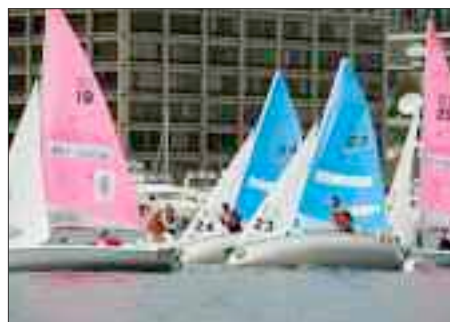
Clay Bischoff, Skipper Silver Panda Team Racing US Team Racing champions