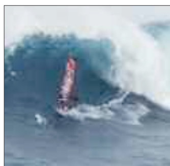
Eyal Sheref (ISR) PWA Windsurfer